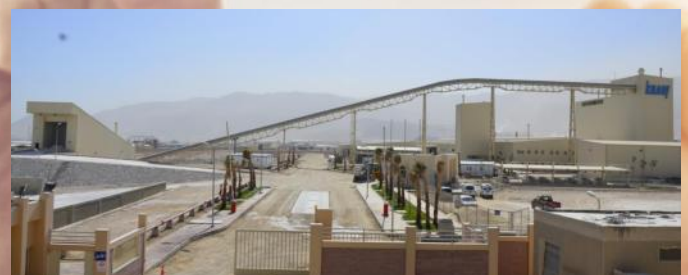
Plant Expansion Inauguration