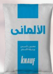
Launch of "AlAlamny" Finishing Powder