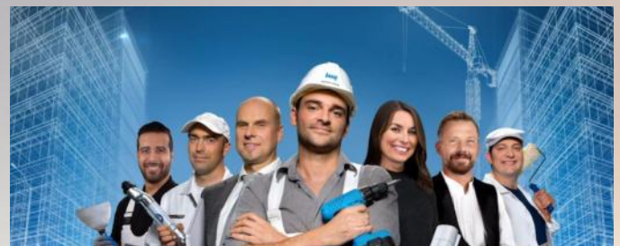
Knauf Werkstage Exhibition in Germany